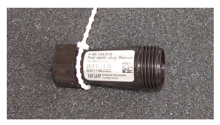
Test Resistor for AMI and FAM Rescon.