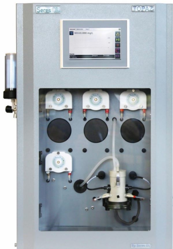
Seres OL Topaz Series Showcase